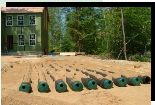
Enviro-Septic® Installation at LEED Certified Home

Presby Environmental was proud to be a part of the second Leadership in Energy and Environmental Design (LEED) residential home built in the state of New Hampshire, this past fall. This "green" home, located in Loudon, was awarded a LEED Silver certification, the second highest rating granted by this distinguished organization. Zetland Homes, Inc., a construction company located in Hopkinton funded the project largely out-of-pocket and needed the support of other eco-friendly companies to help make the project a reality. Presby Environmental donated an Enviro-Septic® System to the LEED demonstration home that was created in part to raise awareness about green building with conventional materials. The debut of the LEED home was a huge success, with over 1,000 people touring the home between October and November. The home was even (Cont. on Pg.3)