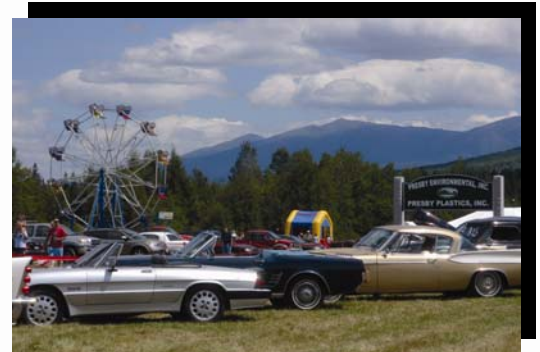
Picture taken at last open house in 2005

On Saturday July 26 th 2008 from 10:00am – 3:00pm, Presby Environmental, Inc. and Presby Plastics, Inc. will be hosting an Open House at their headquarters in Whitefield, NH. Like the last open house, which was held in 2005, the event will feature various rides and activities for kids and parents as well as music, factory tours, an airport fly-In and, of course, plenty of tasty treats to eat and drink! This