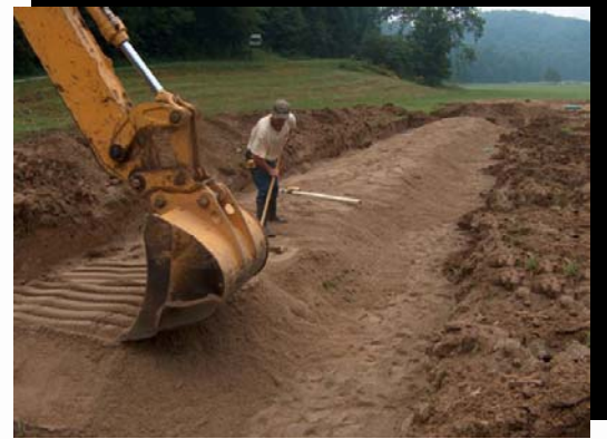
Enviro-Septic® Installation in Indiana